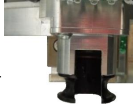
Plastic depth limiter S63

In accordance with our constant struggles to always provide you with the best products and services possible, the plastic depth limiters for ProtoMat S63 and ProtoMat S103 have been replaced with a new generation almost one year ago.