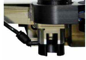
Plastic depth limiter S103

The part numbers for the new aluminum depth limiters are: